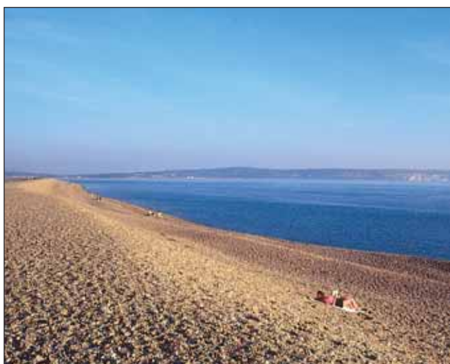
The large-scale and open landscapes of Hampshire's coast