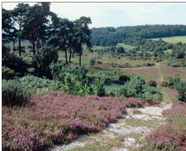
The extensive heaths and woodlands of the New Forest and Hampshire's other heathland areas, associated with the clay lowlands