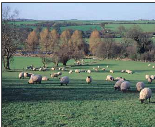
The distinctive low-lying but varied character of Hampshire's main river valleys