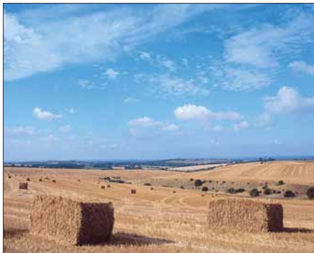
The large-scale, high and sweeping landscapes of the mostly rural chalk downs

Overall, five entirely different landscapes contribute to Hampshire's diversity: