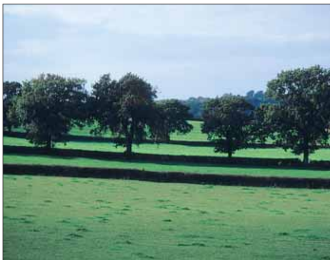
The small-scale, well-wooded and generally enclosed landscapes of the low-lying clay lowlands