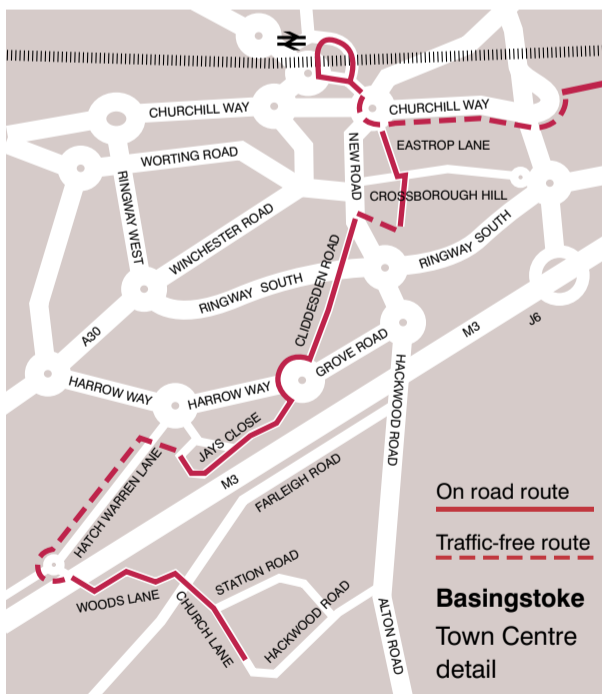
NCN Route 23 From the Thames to the South Coast

Part of the National Cycle Network in Hampshire